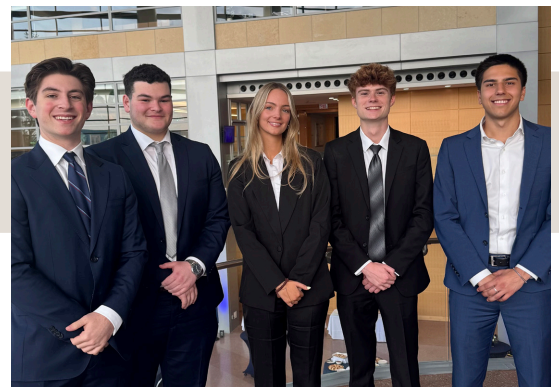
Westgate Development Penn State University