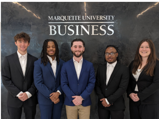
Stonebridge Development Marquette University