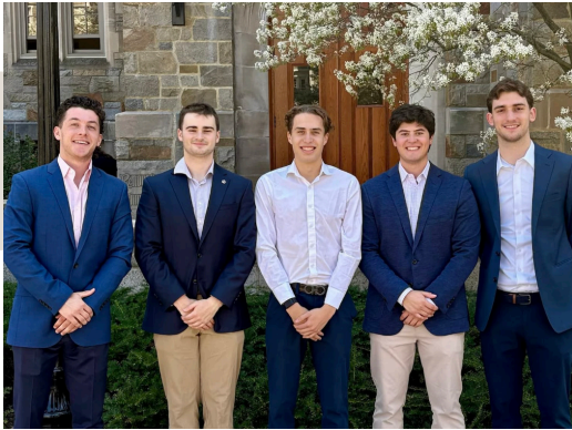
Regatta Grove Boston College