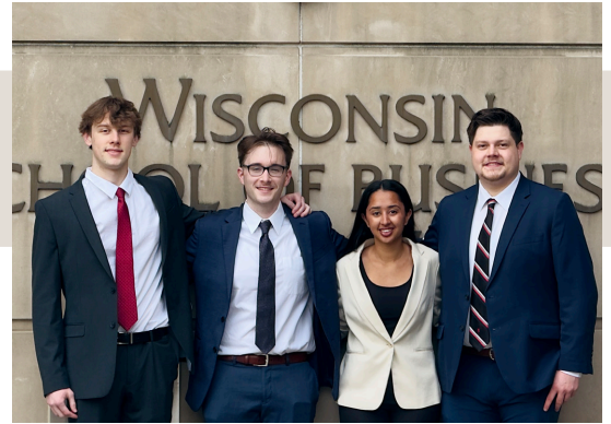
Community Nest University of Wisconsin-Madison