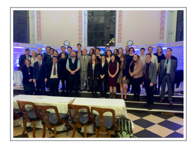
Group photo of the debaters taken in the Trinity College Public Theatre

All three preliminary debates were held in the Graduates Memorial Building. This neo-Gothic Victorian building, constructed in 1897, is the home to three of Trinity College's oldest student societies: theUniversity Philosophical Society (the Phil), the College Historical Society (the Hist) and the College Theological Society (the Theo).