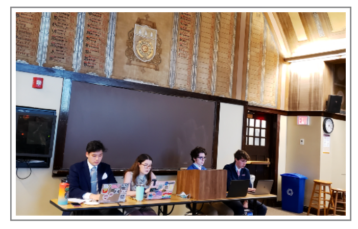
The 2021 Fulton Prize Debate

On May 7, 2021, the Fulton Debating Society held the 129th annual Fulton Prize Debate in Gasson 305 and on Zoom. The students debated in Gasson 305 while the judges and guests viewed the debate on zoom.