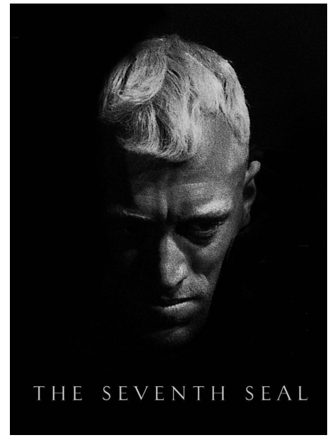
The Seventh Seal movie poster.