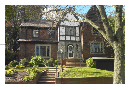
NO. 134: MARCH 29, 2017