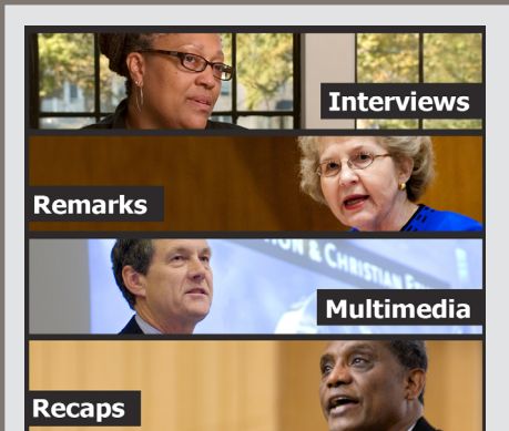
Visit bc.edu/boisi-resources for a complete set of the Boisi Center Interviews and audio, video, photographs, and transcripts from our events.