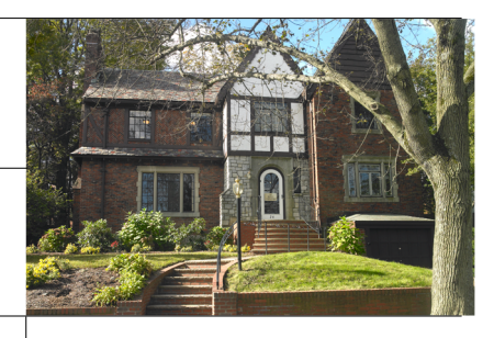
NO. 94: APRIL 24, 2014