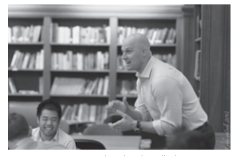
Brennan Symposium.

Without a doubt, he experienced phenomenal success as the quarterback of the Seattle Seahawks. Matt led the Seahawks to the playoffs in six different years, including