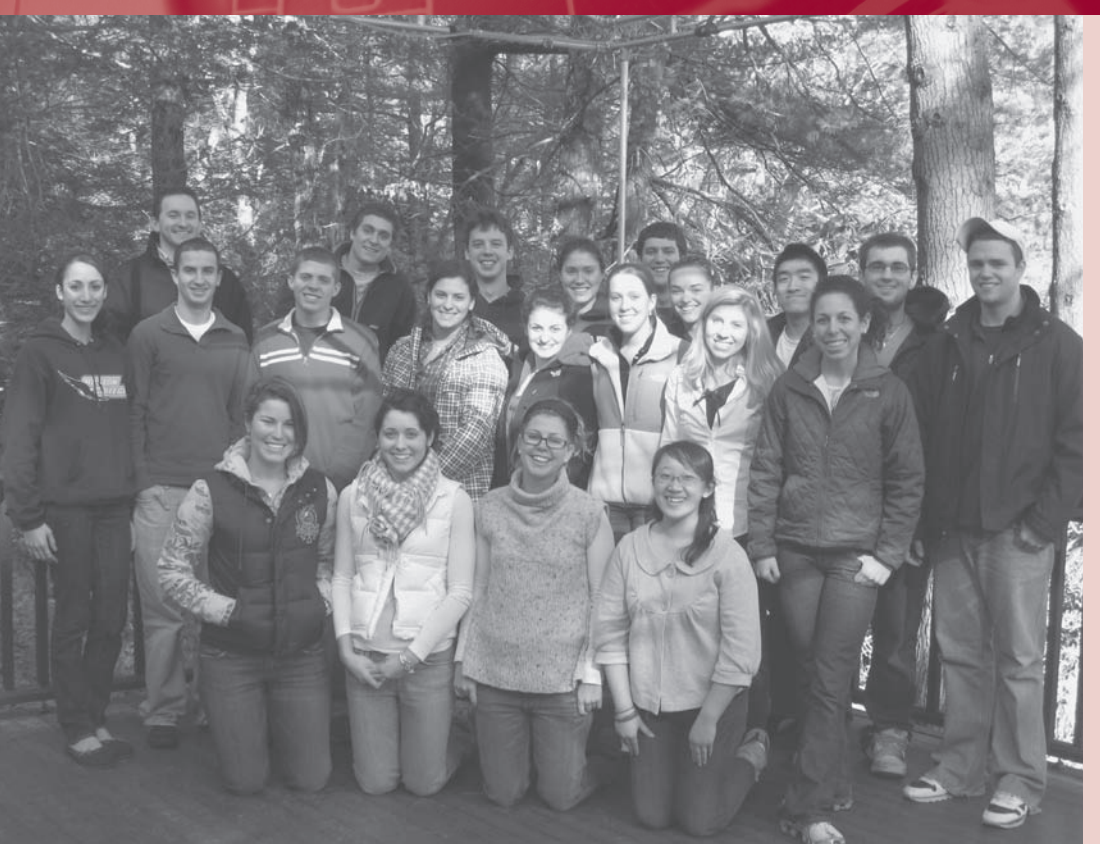
The 2008 Jenks Leadership Group at Whispering Pines Conference Center in West Greenwich, Rhode Island.

THE WINSTON CENTER FOR LEADERSHIP AND ETHICS