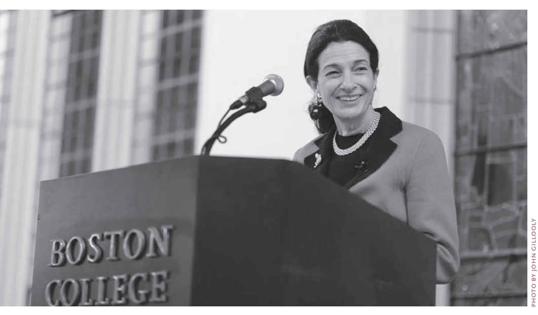
Olympia Snowe, U.S. Senator from Maine, at the Chambers Lecture Series.

On Tuesday evening, February 11, 2014, former U.S. Republican Senator from Maine, Olympia Snowe, keynoted the Chambers Lecture Series and highlighted the increased polarization in U.S. politics.